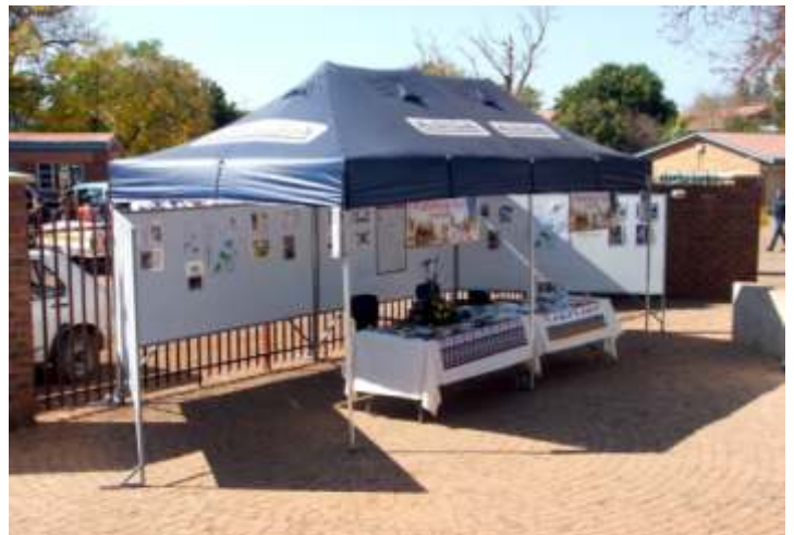
The Forum's 7 meter X 2 meter stand in the main stadion of Naboom during Bokkieweek 2008.

Modimolle Tourism and the Waterberg-Nyl Tourism Forum are represented on these CTA's established for the two adjacent towns and will strive to further the interest of their respective tourism industries there.