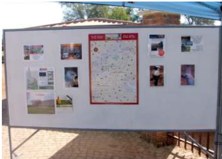
Four large display panels highlighted the beauty and various tourist establishments of the region for visitors.

It is expected that Naboom will also host the 2009 Bokkieweek, and the organisers are thanked, and wished everything of the best, for Bokkieweek 2009.